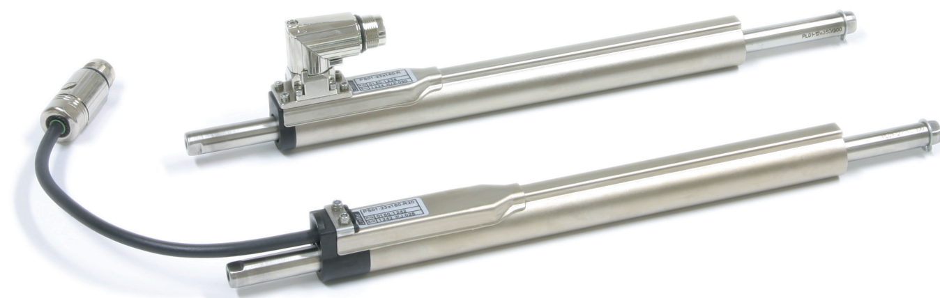
LinMot linear motors have a round form factor that produces very high power densities.

The matching sliders are available as standard products in many variants, for strokes from 20 to 780 mm. The version selected for the MultiSAN has a stroke of 120 mm.