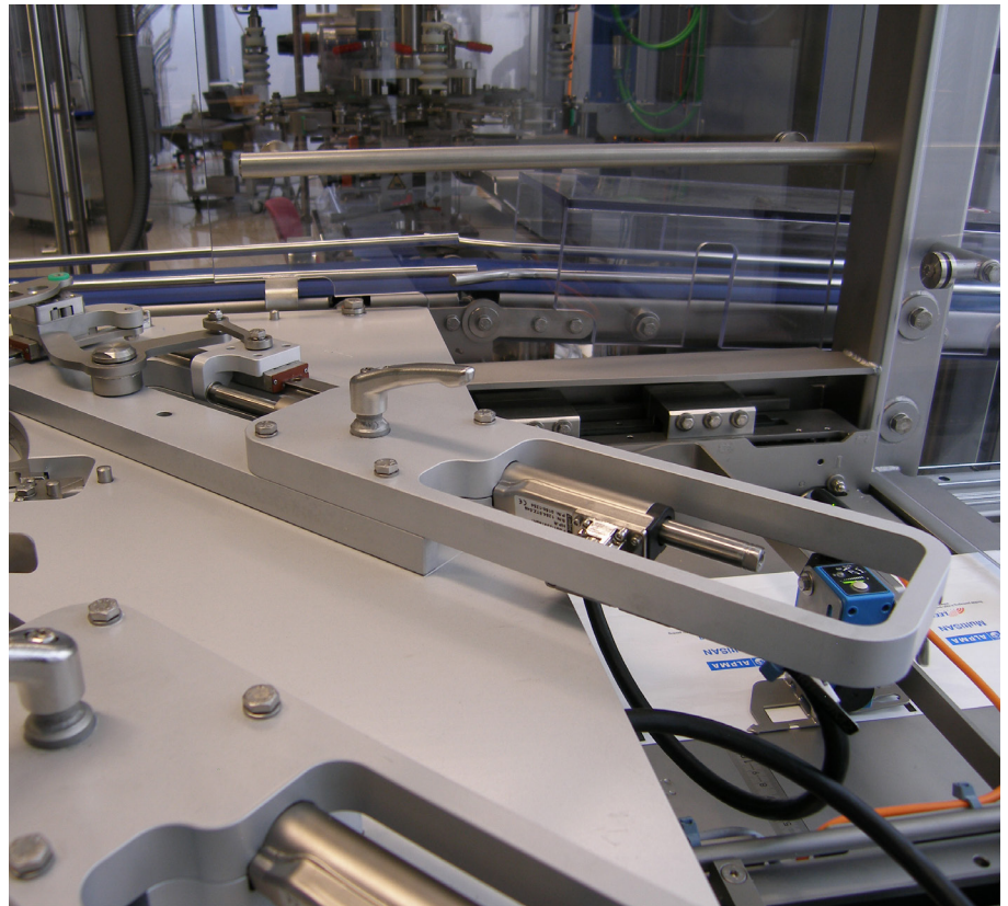
ALPMA built the LinMot motors with the shutter drives into one module that is used in several places on the machines. It is designed to function as a heat sink for the linear motors as well.

Changing formats on the MultiSAN has become conceivably simple due to the consistent modular construction and the use of electric drives instead of a mechanical master shaft. In just a few steps, the closure module can be removed and installed in a different position, without having to disconnect the flexible supply cable for the linear motor. Then the corresponding program just needs to be started from the user-friendly touchscreen controls, and then the same machine that had