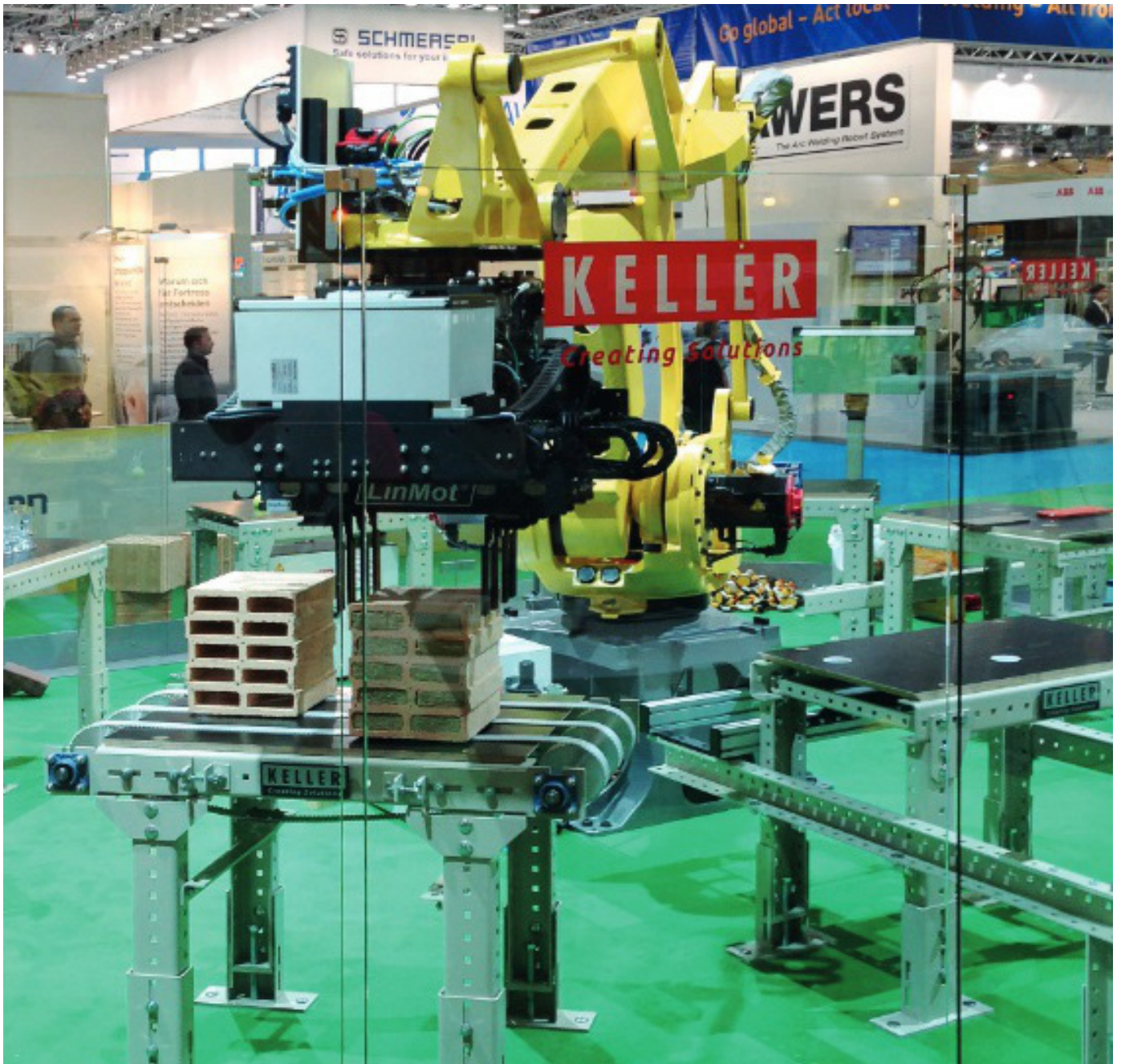
The robot gripper developed by Keller HCW, with linear motors, is universally deployable and can safely and gently pick up even sensitive products and group them prior to setting them down.

«In practice, however, it is very difficult to adjust the pneumatics,» says Reinhold Ungruhe. «Just the fact that the pneumatic actuators behave differently depending on the ambient temperature, and therefore the precise adjustment of the gripping point and the grip force is only partially possible.» The condensate water and other contami-