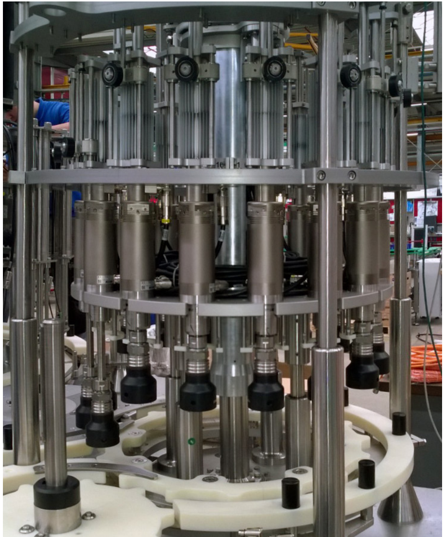
The monoblock line has space for 16 closing stations. Linear-rotary motors allow rapid product changeover and broaden the range of application of the filling and closing machine.

«We can use the data provided by the drive to determine the number of revolutions actually performed, so that a separate check of the height of the closed container in order to monitor the screwing process can also be eliminated,» adds Franz-Josef Patzelt, citing a practical example. The drive data for snap-on caps can also be usefully applied for monitoring purposes. An error message can be generated if a prescribed value for the snap-on force is exceeded due to an interfering injection point.